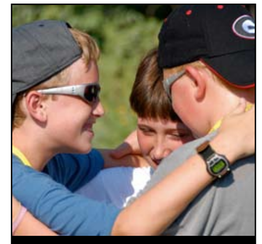
The most valued characteristic of a person, in any venue of life, has been shown to be trustworthiness. The old adage is true: "You cannot make a good deal with a bad person."

Servitude and service are different. Servitude is involuntary. Service is voluntary.